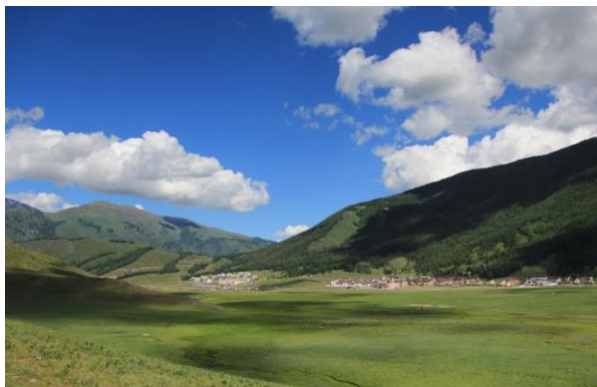
Kanas scenic area

Competitors will gather at the tourist centre of Kanas Scenic area for pre-race activities. Kanas is known as the Chinese Swiss town by its charming scenery. Competitors can relax and enjoy attractions, including Kanas lake where the kayaking starts, traditional Kazak culture, and the golden-red forest.